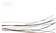
Figure 8. Typical intensity profile of the individual emitters (fast axis collimation plus slow axis imaging) within a soldered laser bar (left) and a clamped laser bar (right).

As these laser diodes generate large amount of heat fluxes that can adversely affect their performances and reliability, a thermally-effective packaging solution is required to remove the excessive heat ...